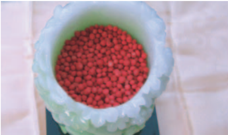
After the nectar pills were distributed to attendees and before dharma was practiced at the Food Offering Dharma Assembly, the bowl of nectar pills was not full. 在將金剛丸分發給參加法會的人之後而在上供法會修法之前，沒有滿的一鉢甘露丸。