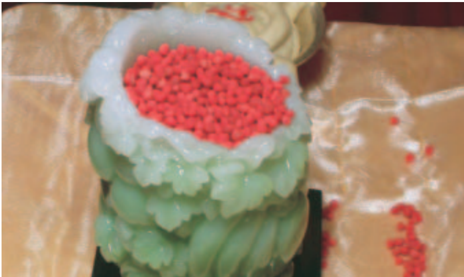
One hour later after dharma was practiced at the Food Offering Dharma Assembly, the nectar pills instantly grew in number, filling the entire bowl and lots of nectar pills dropt to the table. 上供法會修法一個小時之後，甘露丸剎那暴漲，漲平成了滿鉢，很多掉在法台上。

inside a jade bowl. At that time, the nectar pills were level with the lower edge of the brim of the bowl. Those nectar pills were piled up evenly and filled the entire bowl. The Buddha Master later empowered the fifty-nine attendees of that dharma assembly by giving each of them some of those nectar pills. As a result, the nectar pills that remained in the jade bowl were lower than the lower edge of the brim of the bowl by about 1.5 centimeters. We saw that the nectar pills neither lessened nor increased from 7:03 p.m. when the practice of the dharma began until around 8:10 p.m. when the offerings of the three karmas to the Buddhas was completed. At that time, a holy event nobody ever imagined suddenly took place. In an instant, the nectar pills grew in number. Not only did the pile of nectar pills rise more than 1.5 centimeters filling the entire bowl, its top part formed a dome that rose high above the brim. Everyone was ecstatic at the sight of that holy