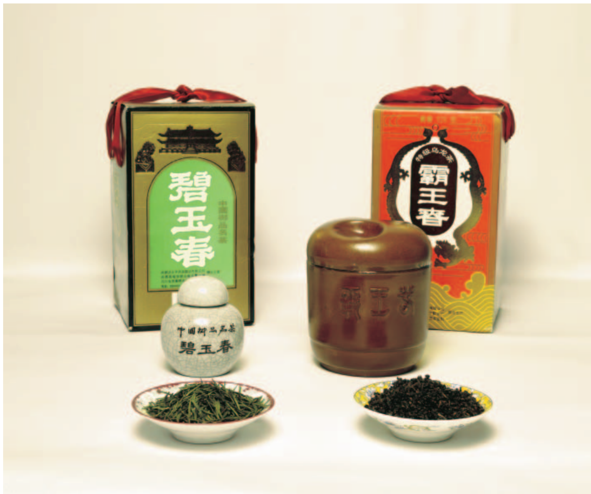
Bi Yu Chun is known as the foremost of Chinese famous teas. 被譽為中國名茶之首的碧玉春