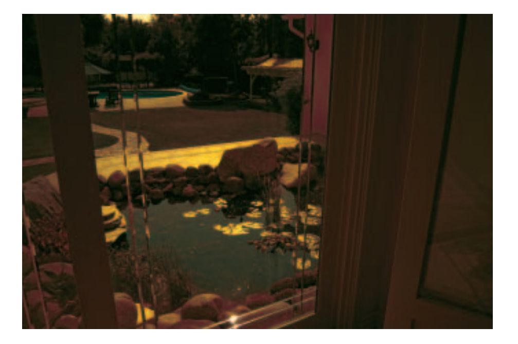
Golden Garden Path 金色庭園路