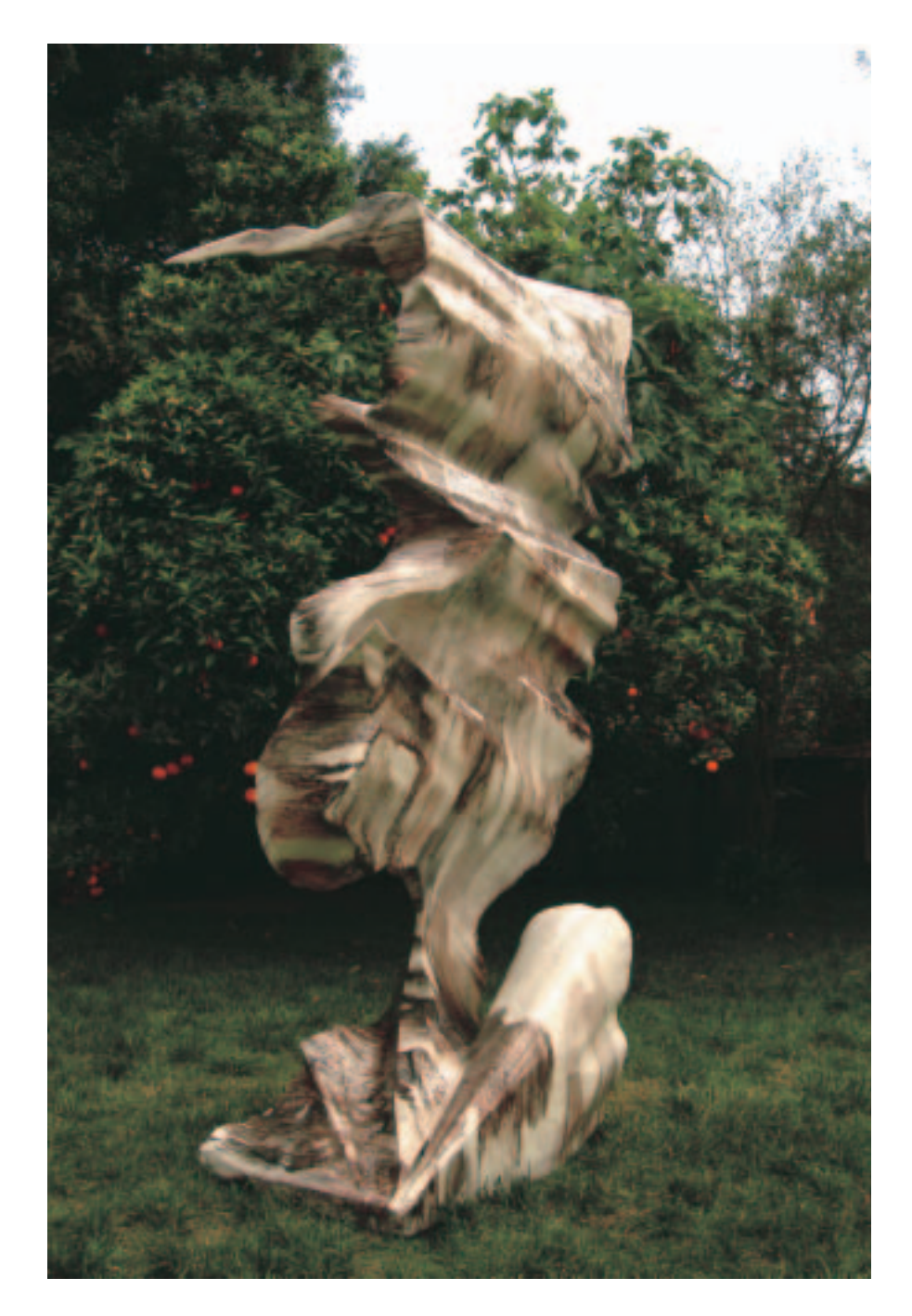
The decoration in the middle of the garden is a faux white jade sculpture called "Melody in Motion." It seems to change constantly when viewed from different angles. 庭園中央裝飾的羊脂玉雕塑「動的旋律」,八面觀看變化無窮