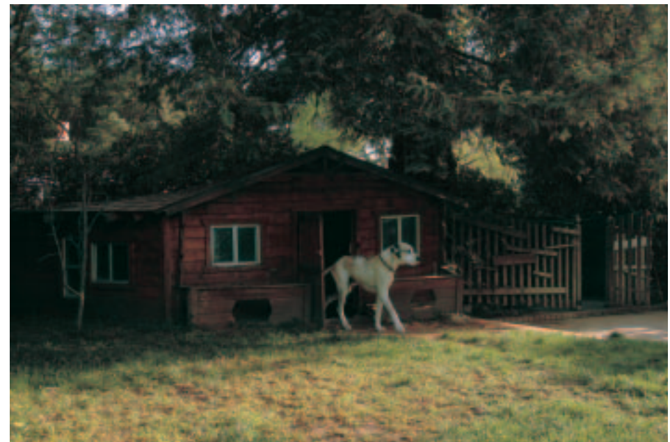
A "country villa" designed for a dog 為狗設計的鄉土別墅