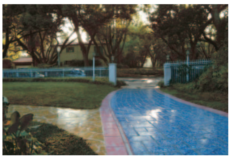
Hollywood Movie Scene 好萊塢電影取景場