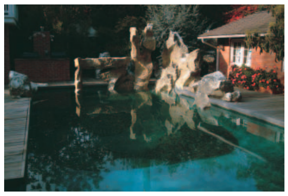
Part of a house garden that was designed by H.H. Dorje Chang Buddha III. 三世多杰羌佛設計的房屋庭園一角