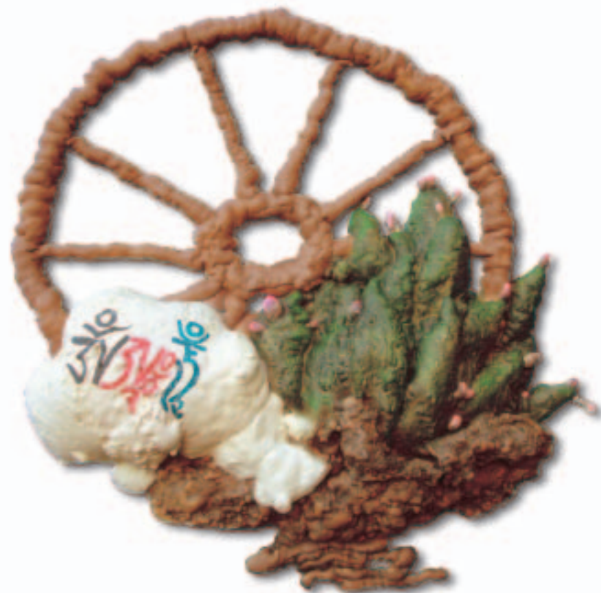
Mani Treasure 瑪尼藏