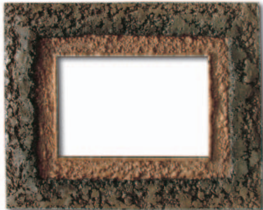
The sculpture Zang Wang Lu Gua 雕塑藏王爐挂