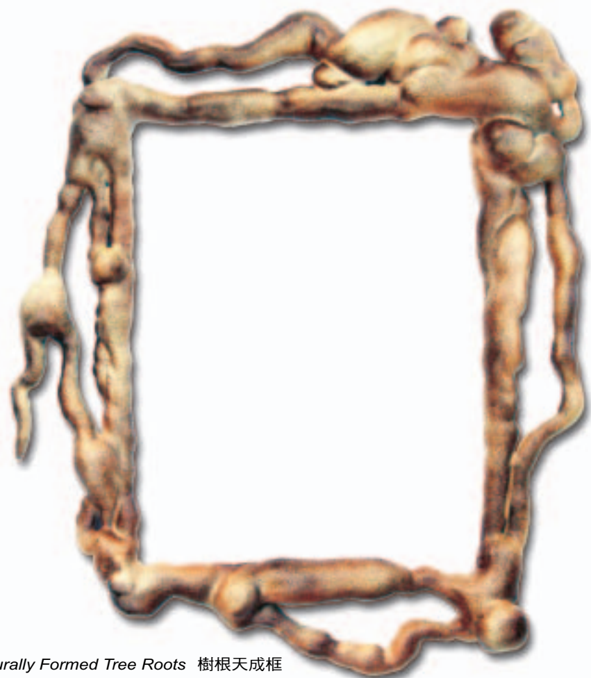
Naturally Formed Tree Roots 樹根天成框