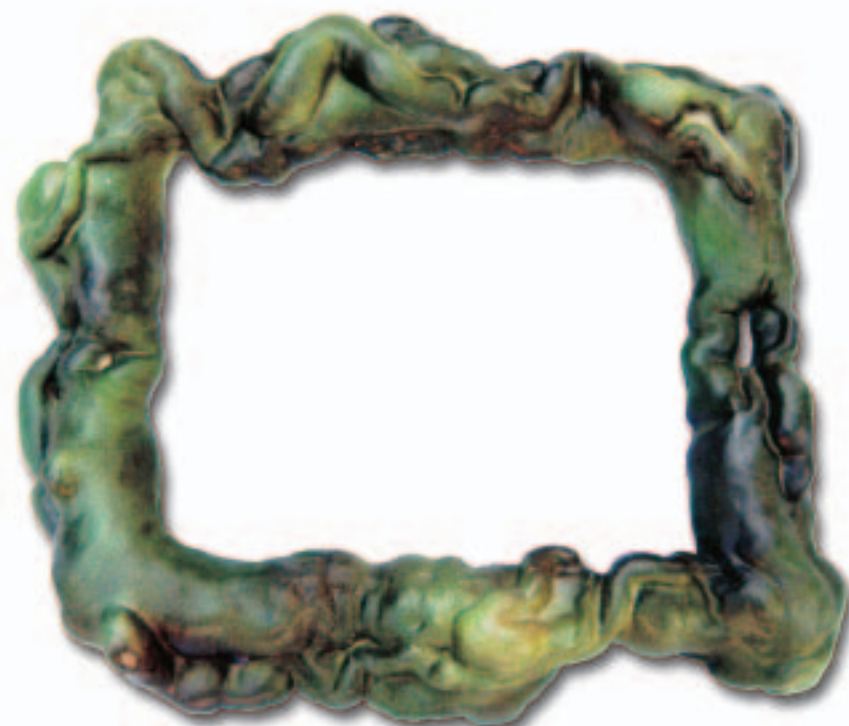
Jadite Green 碧翠