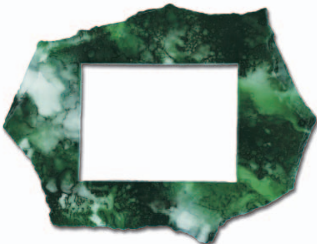
The sculpture Fei Cui Yu 雕塑翡翠玉