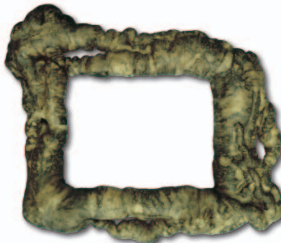
The sculpture Zi Tan 雕塑紫檀