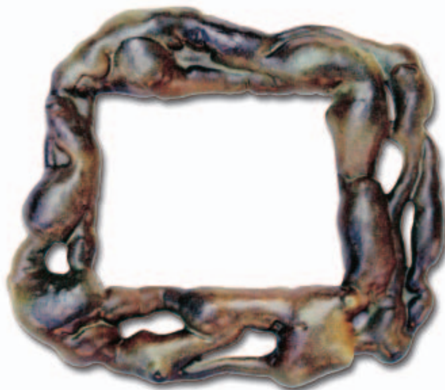
Twining Tree Roots 盤樹框