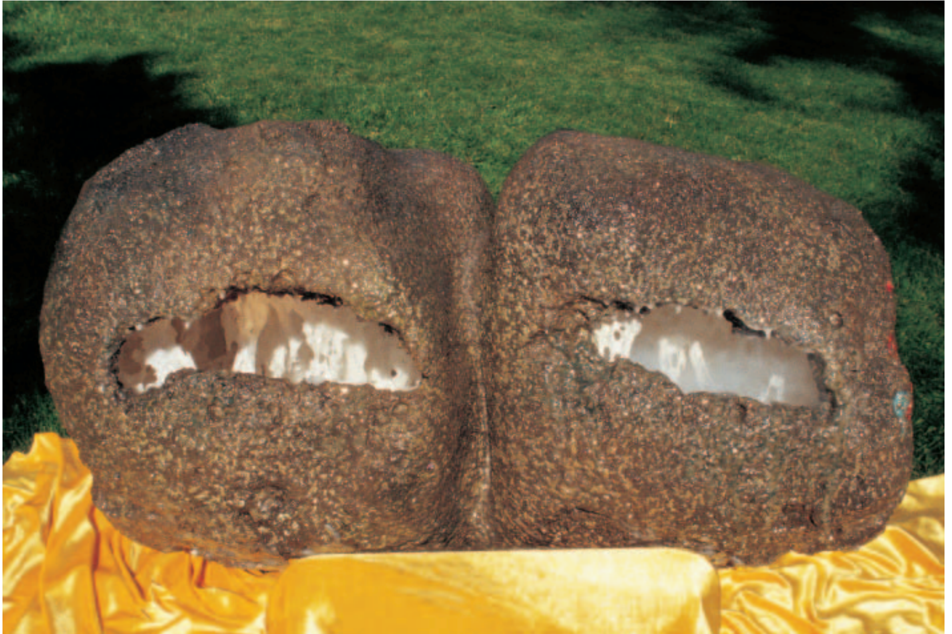
Mysterious Boulder with Mist 神秘石霧