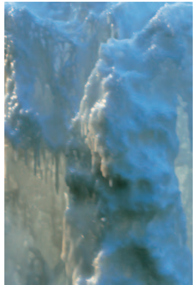
Hanging Ice Stream in Thick Mist 冰流倒懸霧氣濃