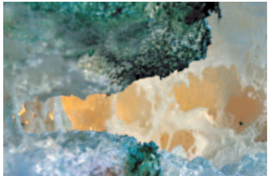
How Could Such Depths Be Fathomed? 深豈能測