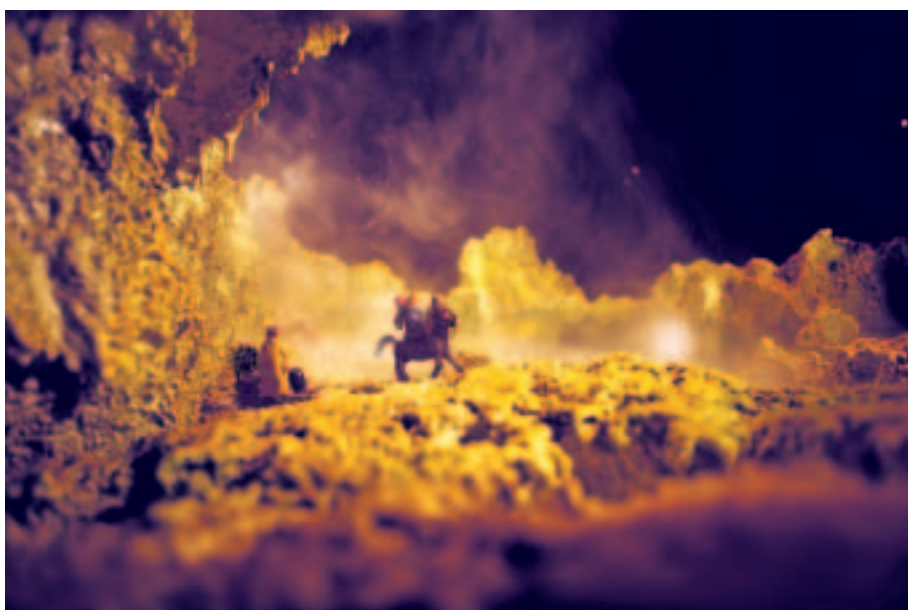
Visiting My Immortal Friend in the Swirling Mist 煙甲縹緲訪仙朋