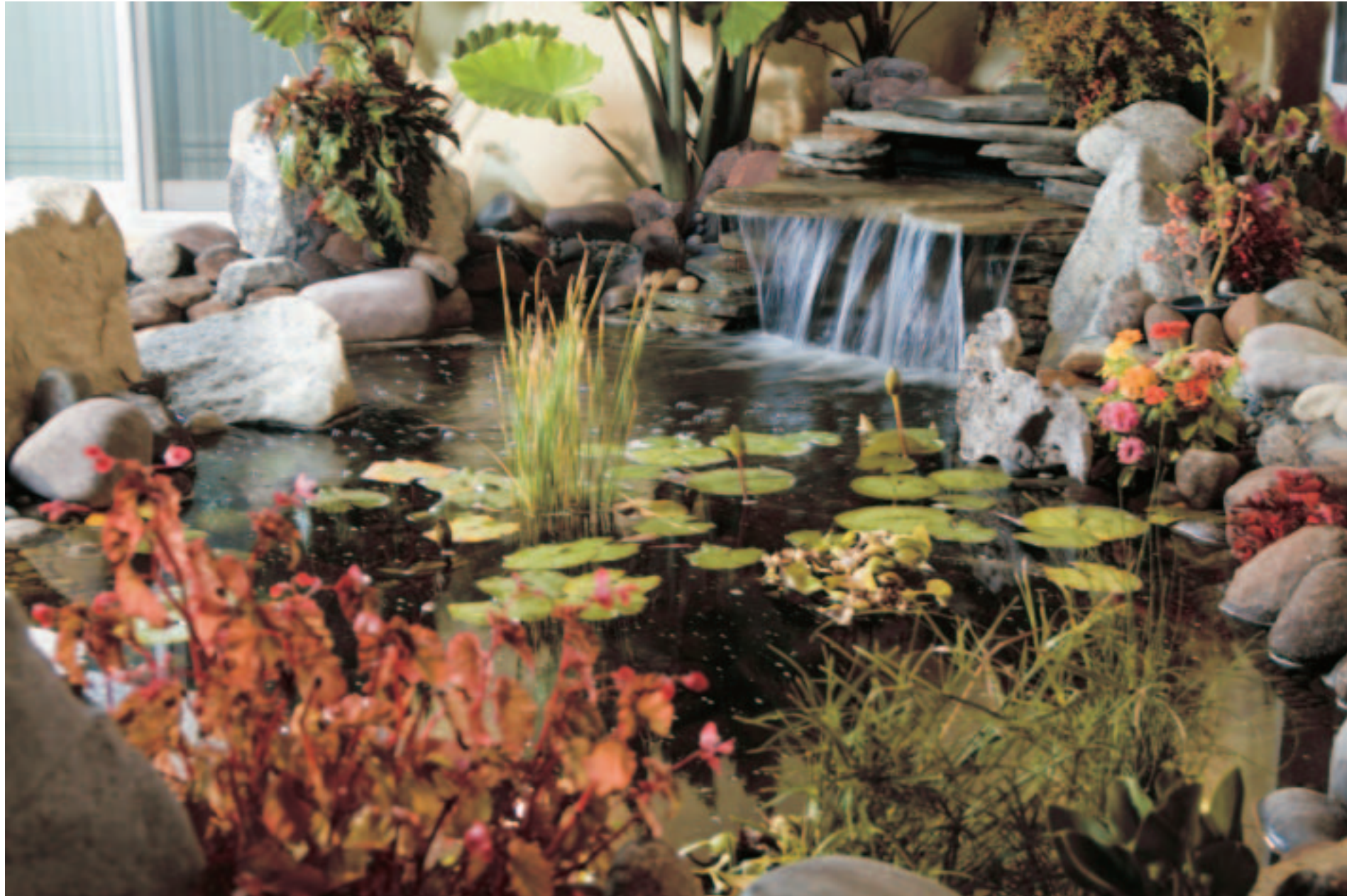
Hearing the Sound of Frogs in the Lotus Pond Stone Valley 蓮池石谷聽蛙聲