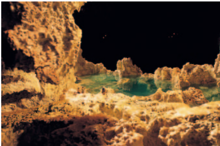
Inverted Reflections of Lakes and Mountains 湖山倒影