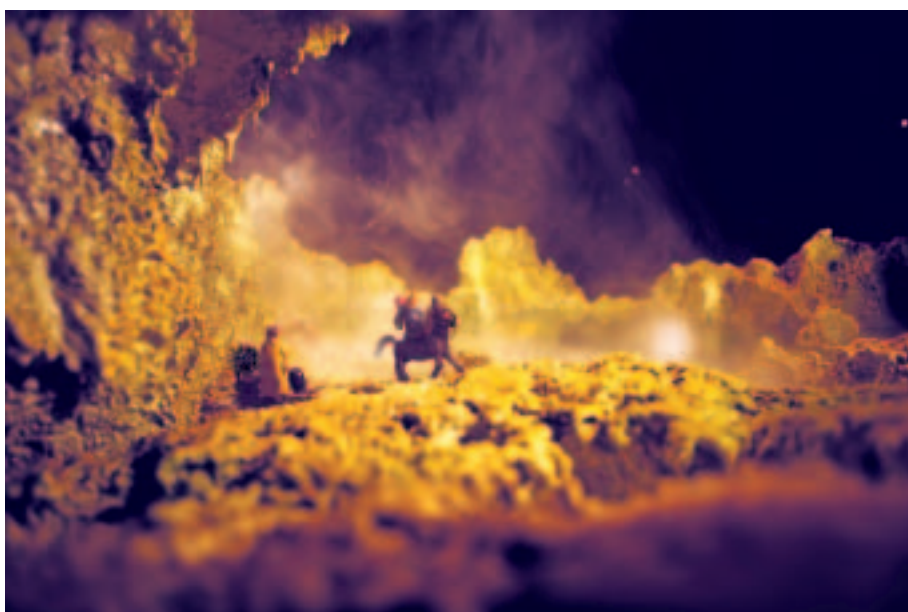
Visiting My Immortal Friend in the Swirling Mist 煙甲縹緲訪仙朋