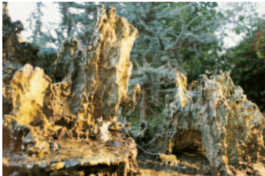
An Old Sage Binds a Mischievous Tiger 仙翁縛拿頑子虎